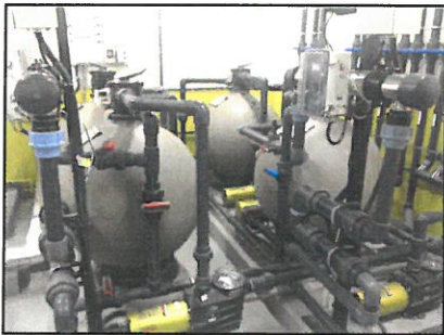
Tandem of 4 each S360T2

Tandem installations allow for easier filtration system placement in tight equipment rooms. They also allow for the servicing of individual components without taking the total filtration system off-line.