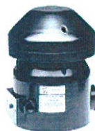
Silent Whisper Jet II

All models of Air Supply blowers are available in 220-240V-50/60HZ and are regularly stocked and ready for prompt shipment.